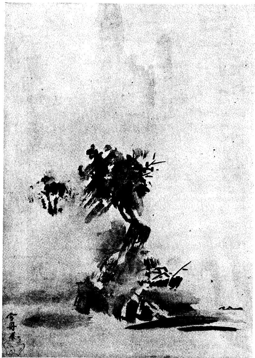
Haboku Landscape. By Sesshu (1420-1506). Tokyo Museum.