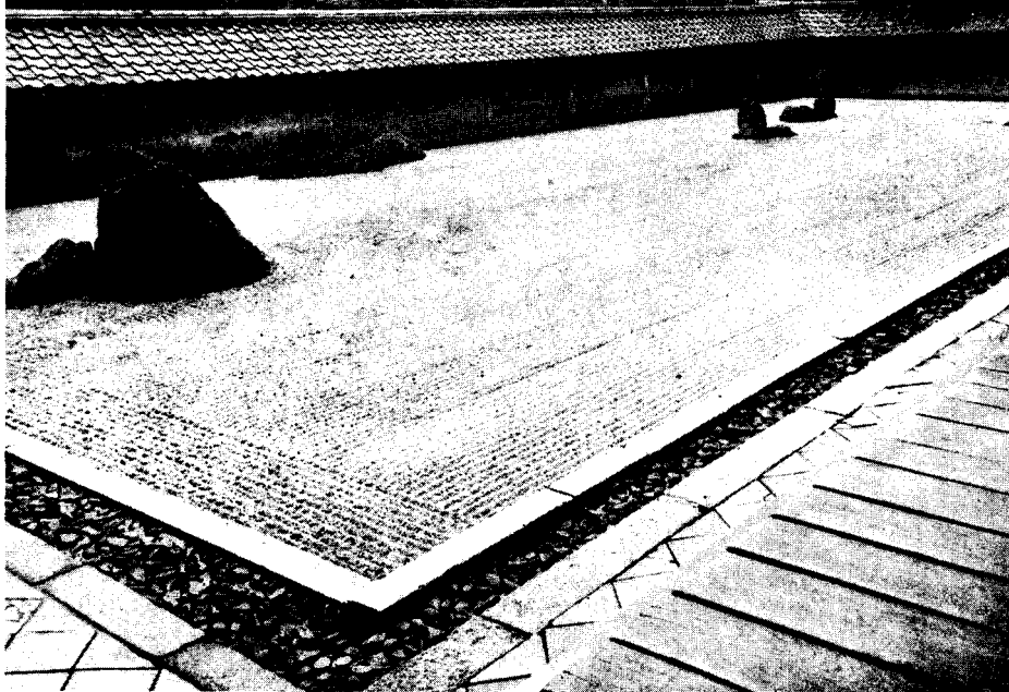
Two views of the rock and sand garden at Ryoanji, Kyoto.