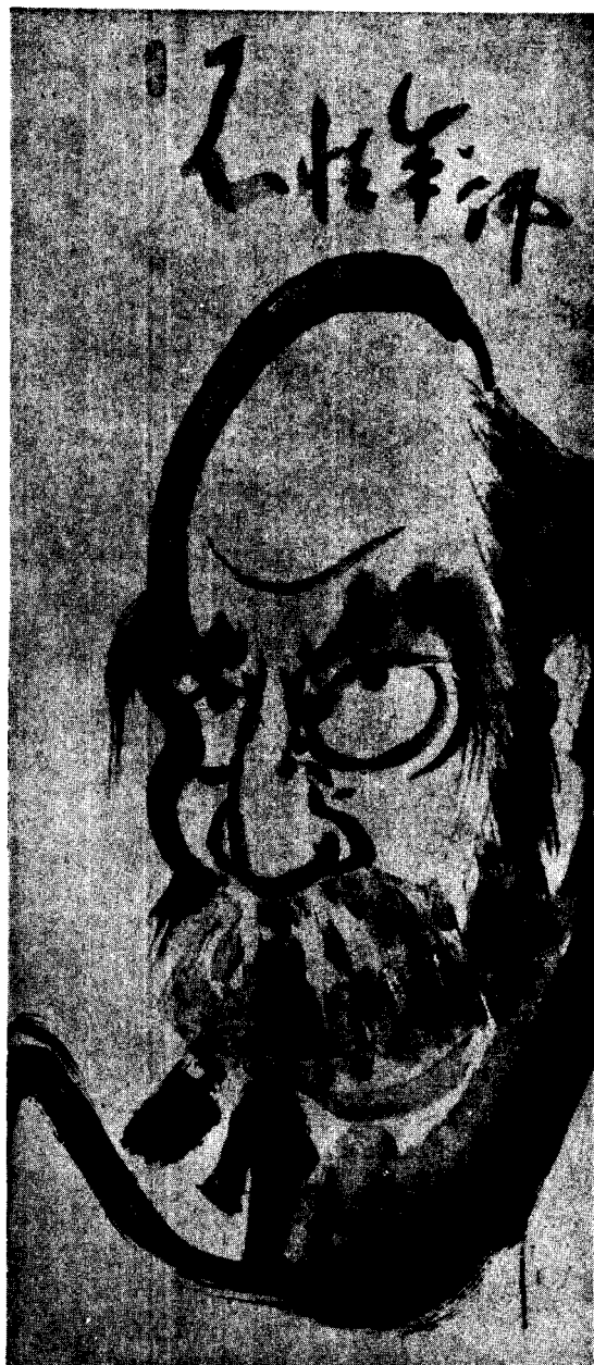
Bodhidharma. By Hakuin Zenji (1683-1768). Yamamoto Collection.